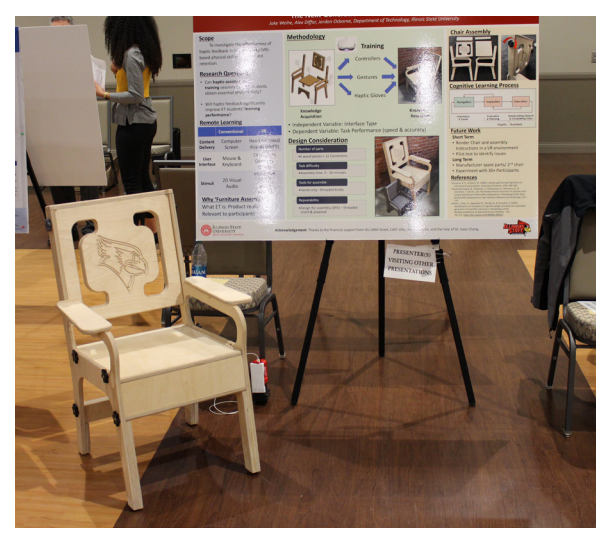
To the left, a student presents their research poster. To the right, a wooden chair sits next to the research poster describing it's creation.