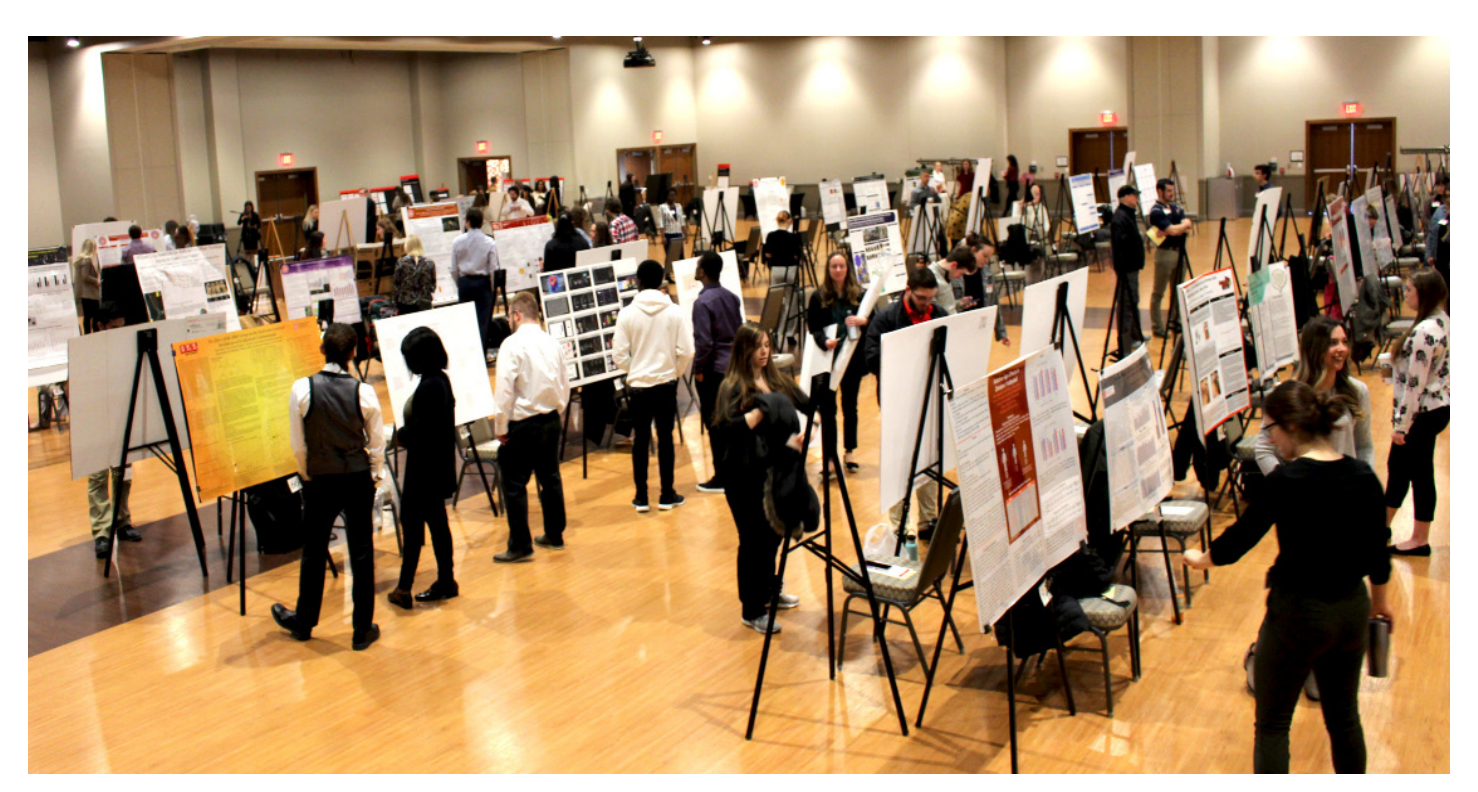
Photo above, an overhead view of the symposium with students presenting their posters on easels.

The day brought many visitors to the symposium from faculty/staff, students, administration, and the general public. The Graduate School would like to thank all students and faculty mentors who were involved in the year's symposium.