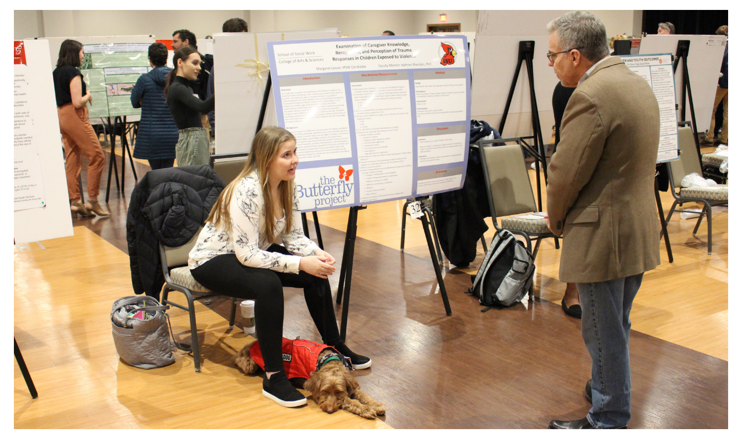
Above, a presenter explains their research while their service dog naps at their feet.