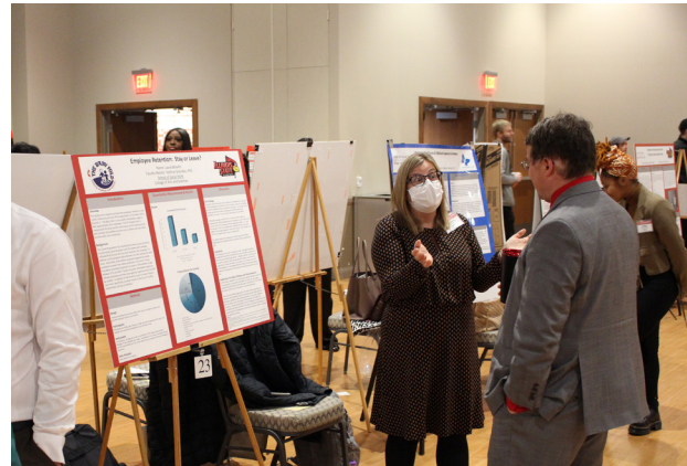
Above, three photos of students with their posters telling visitors about their research.