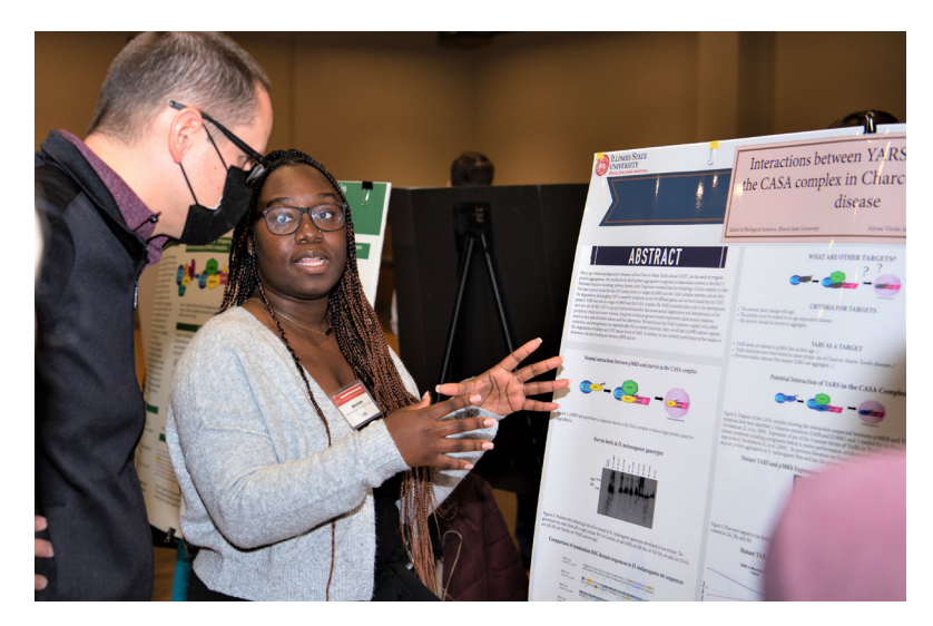
In the three photos, above, student presenters talk about their research to students and faculty.