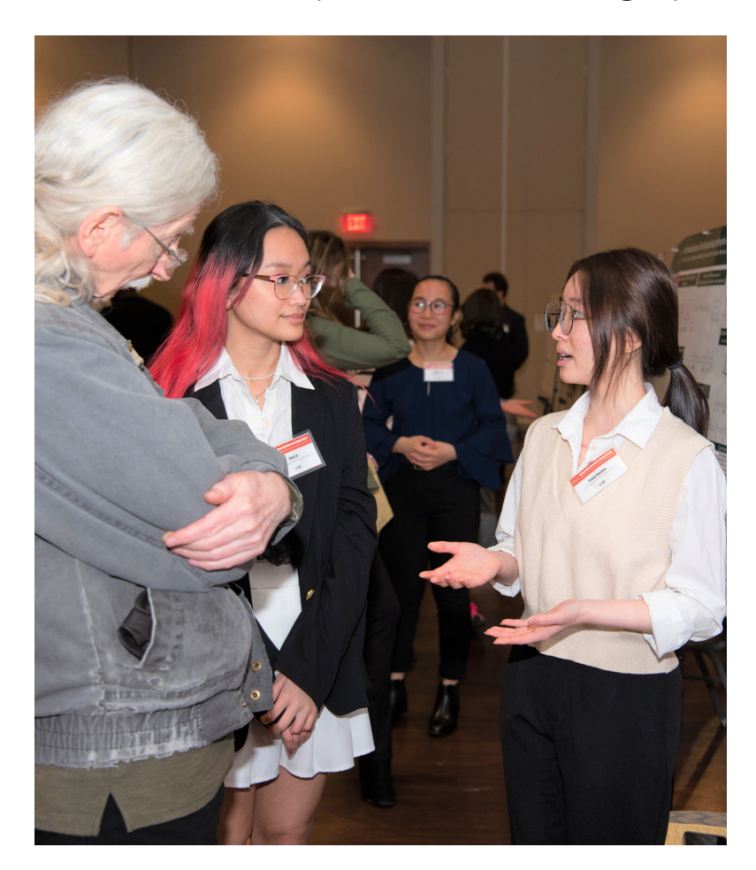
Above, a presenter describing their research.