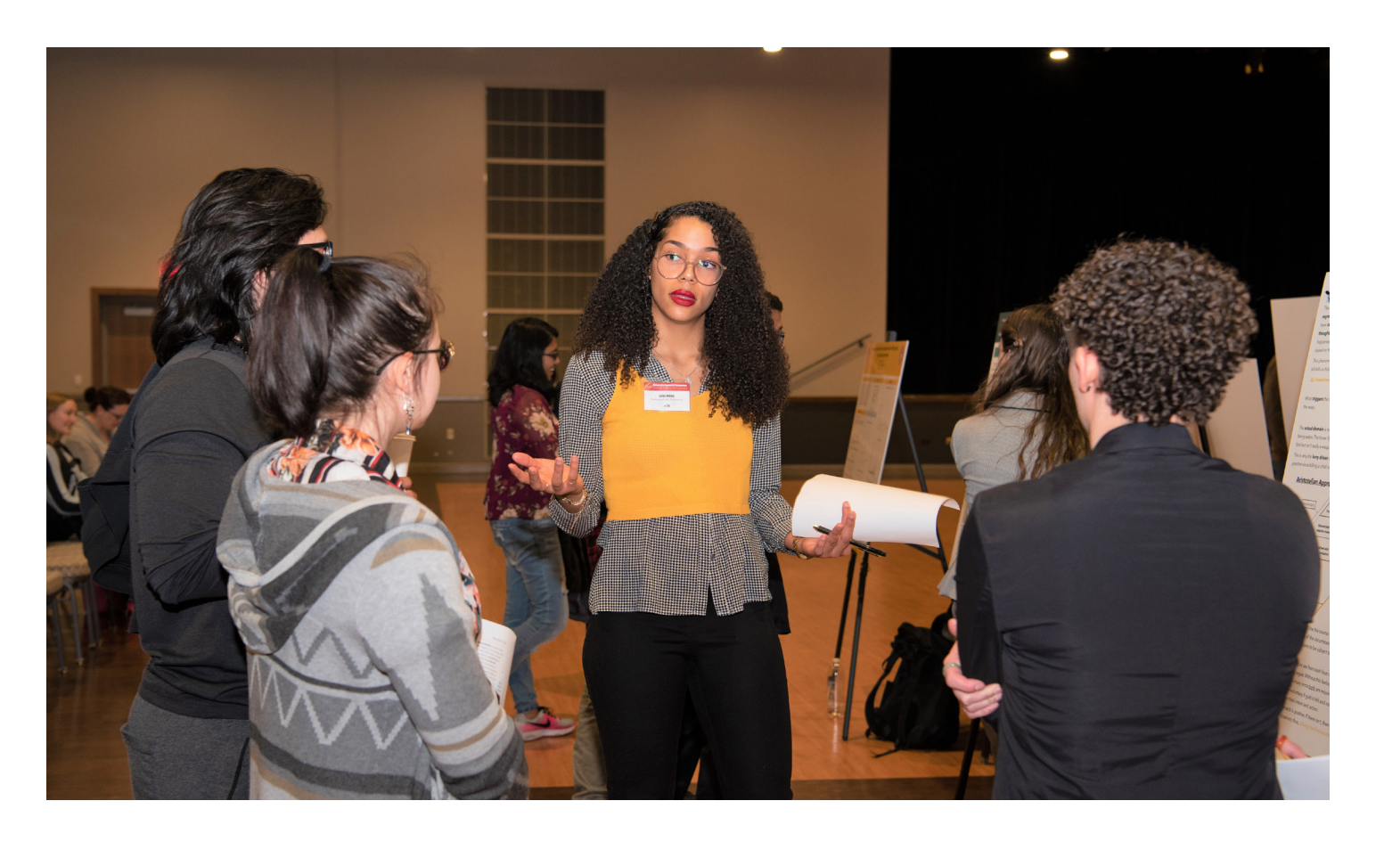
Above, a student explains their research to a group. Below, a student presenter answers questions.