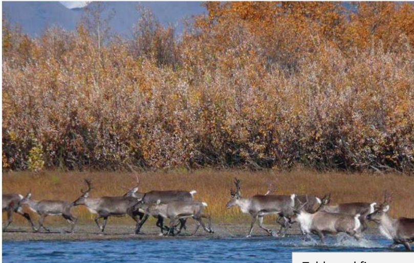
Figure A-1. Caribou crossing Colville River tributary

Table and figure numbering correspond with each appendix letter