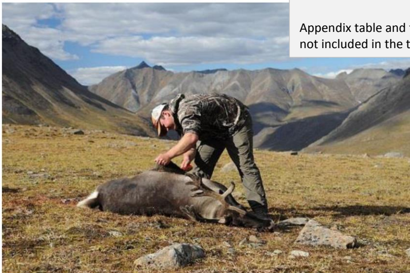
Figure A-2. Field dressing an injured caribou

Table and figure numbering correspond with each appendix letter